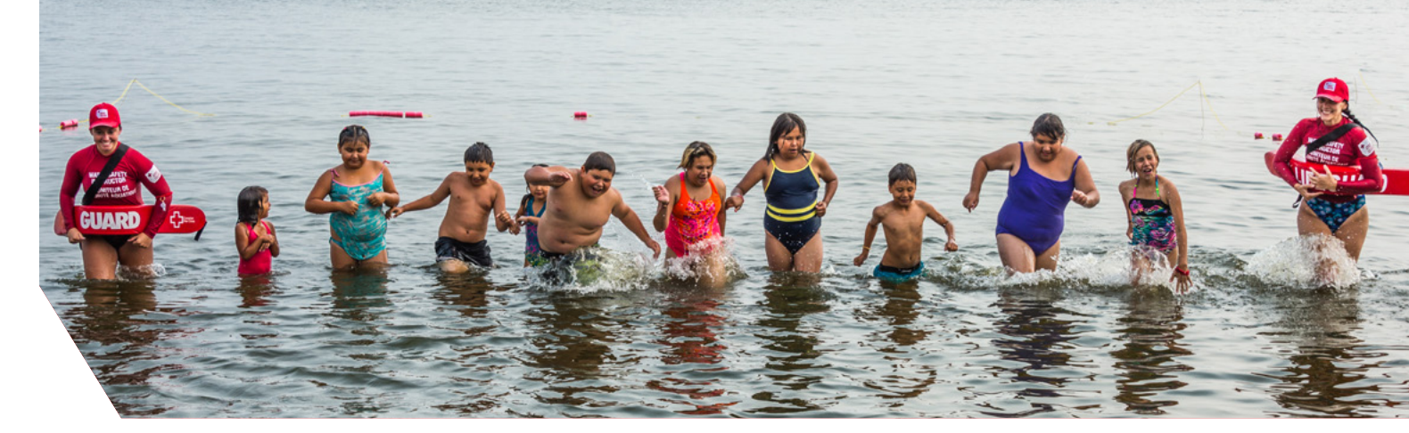
Aboriginal Water Safety Program