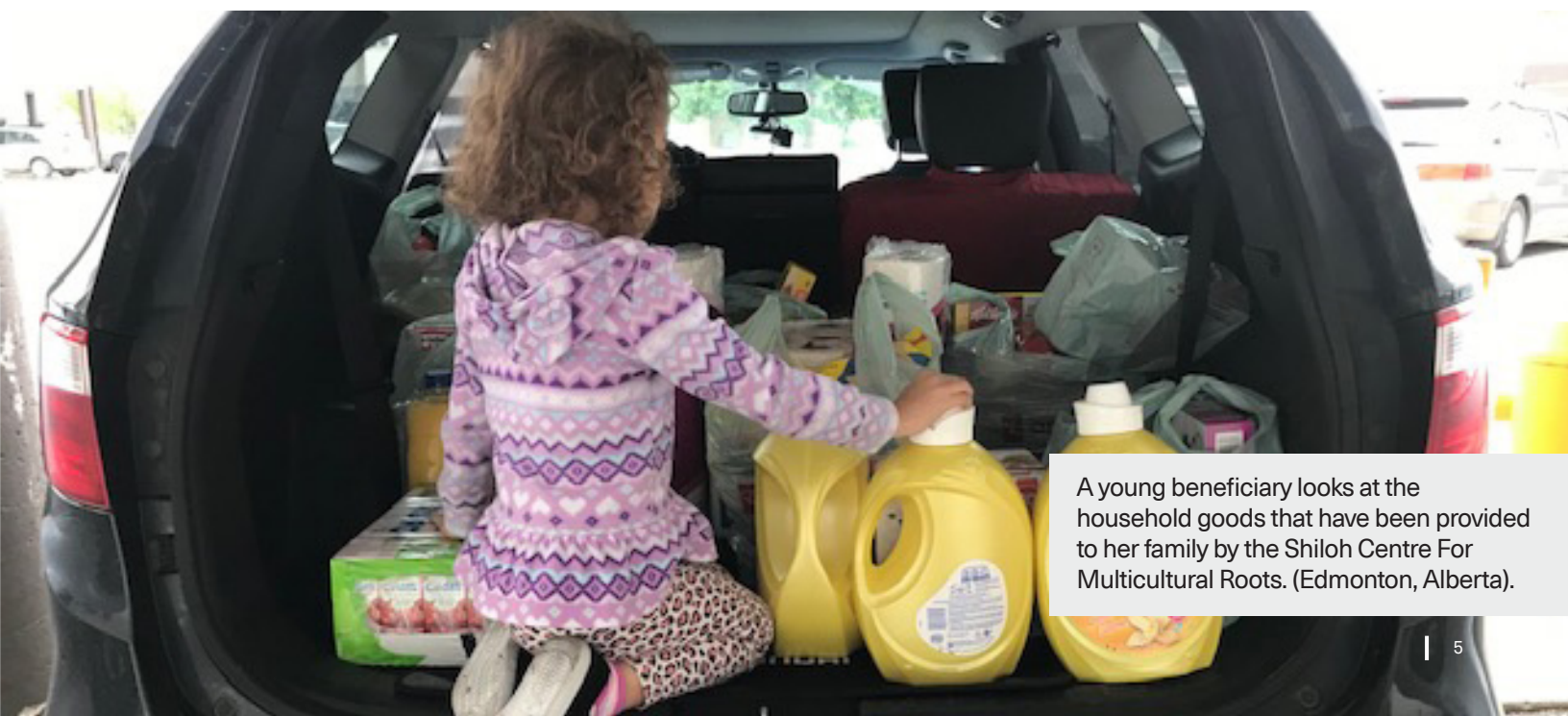
A young beneficiary looks at the household goods that have been provided to her family by the Shiloh Centre For Multicultural Roots. (Edmonton, Alberta).

The Fundamental Principles will be considered when assessing all applications. As noted in this Guideline, organizations and their activities must align to the Canadian Red Cross charitable objects and adhere to the Fundamental Principles and humanitarian values of the Canadian Red Cross.