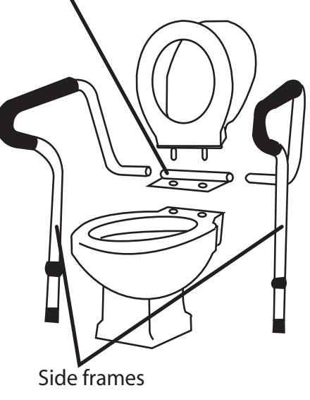
Figure 2: Installation