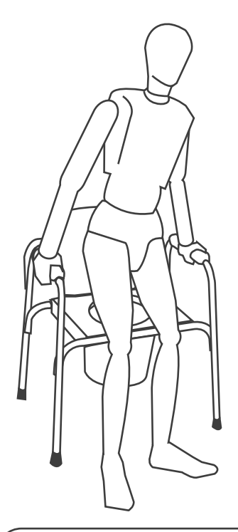
Figure 2: Use armrests when sitting down or standing up

• Pushing against the armrests, slowly raise yourself from the commode. Bend at the knees if possible.