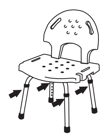
Figure 1: Adjustment areas on legs

WARNING Only use the bath/shower chair on tub and shower floors that are wide enough to ensure stability of all four legs.